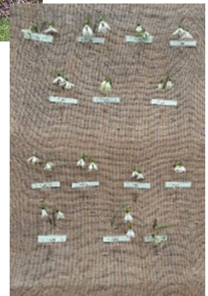
These are a selection of photos of the day. On the right is a banner showing different snowdrops and above is a cropped section to show you the difference in some varieties.

Kenton and Powderham WI featured on the front cover of Devon News last month as winners of the E&RA Centenary Challenge.