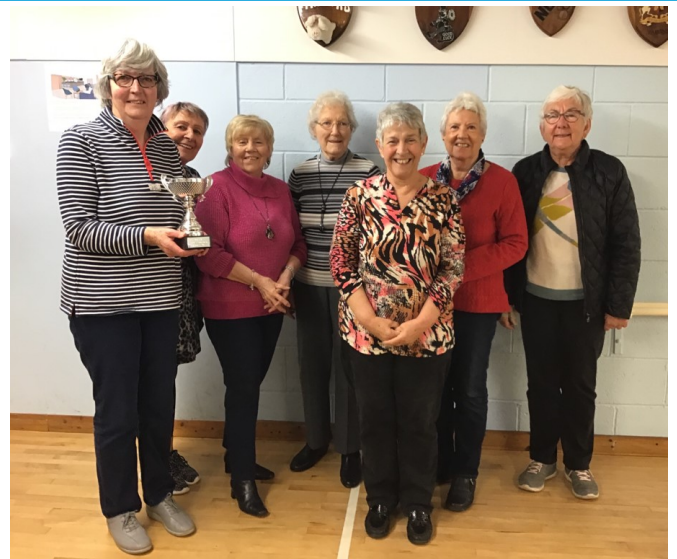
Halwill WI and Elburton WI are pictured with the shield and cup as winners and runners up of the 2021-2 Skittles competition.

A few reminders about being a WI member, or a Committee member_: