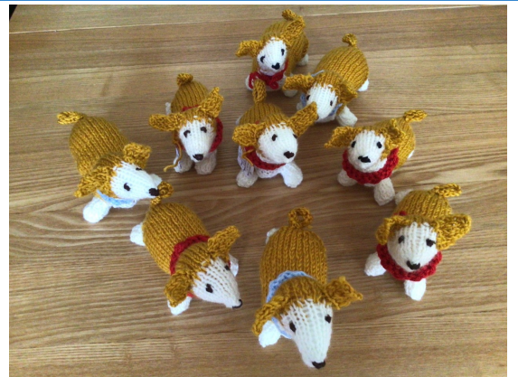
This photo is of 'a clutch of cute corgis' knitted by Sheila Pillar, one of the members of Wembury Bay WI